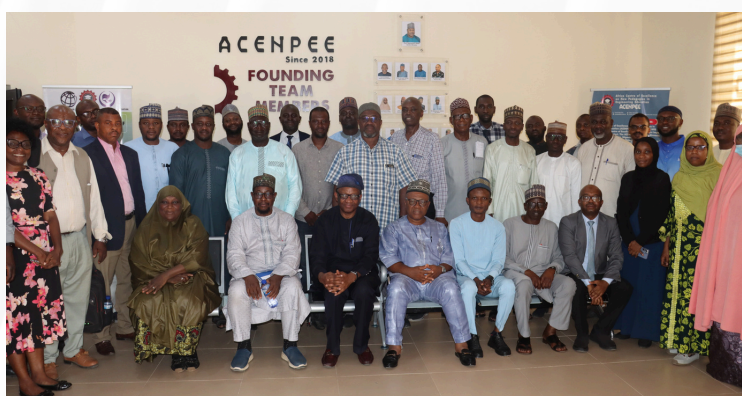
Fig. 1: CBR Facilitators and attendees of the RCR training in Zaria

Institutions in Nigeria that are interested in training Research Integrity Officers and establishing Research Integrity Units should contact the Administrator, Center for Bioethics and Research ( admin@bioethicscenter.net ) for more information. You can also visit the project website at https://sureproject.net to know more about Scaling Up Research Ethics and Research Integrity (SURER) project.