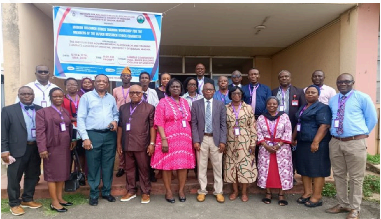
Fig. 4: CBR Facilitators and U.I./UCH Ethics committee members at the end of the HREC training