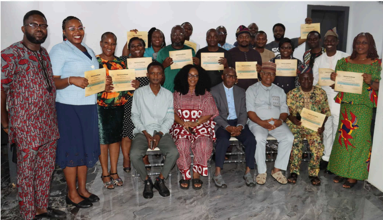
Fig. 2: 3rd Cohort of RCR diploma trainees and CBR facilitators at the end of their 3 – months program.

All the trainees received textbooks, stipend for internet access, and full sponsorship to the mandatory weekend retreats of the program. Our 3-month program provides advanced training in research integrity and Responsible Conduct of Research (RCR) for researchers, lecturers, and institutional leaders based on the 3-credit core courses completed by MSc trainees. The RCR diploma program is designed for individuals who want more than an introductory course in RCR but are unable to pursue an MSc. program. You can visit our project website at https://sureproject.net to know more about how to apply for the program.