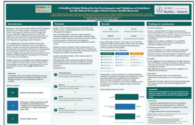
Fig. 10: Poster presented at 7th ELSI congress meeting