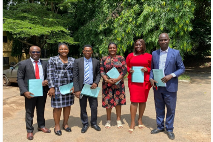
Figure 1: MSc. Bioethics trainees – 1st Cohort with their theses.

Our MSc. Bioethics program with concentration on Responsible Conduct of Research (RCR) has continued to support trainees studying Bioethics with focus on Responsible Conduct of Research at the Department of Bioethics and Medical Humanities (DBMH), University of Ibadan. Some of our pioneer set of trainees who successfully defended their thesis at the University of Ibadan are currently working on publishing their research projects in reputable journals. CBR will support these publications to build evidence base for RCR practice, and creation of more awareness of RCR in Nigeria and globally.