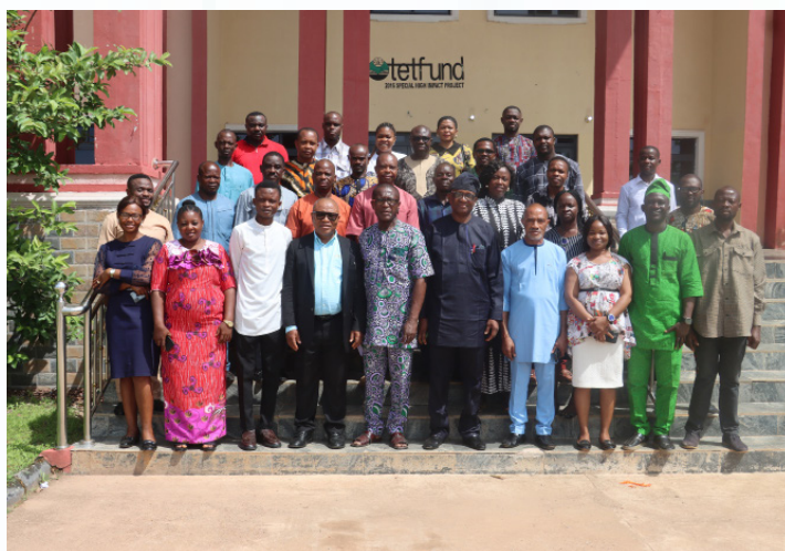
Figure 5: CBR Facilitators and attendees of the RCR training at Ebonyi State University

The Scaling Up Research Ethics and Research Integrity (SURER) Project implements a multi-institutional collaboration to develop Responsible Conduct of Research (RCR), Research/Scientific Integrity (RSI) training programs for researchers in Nigeria. During the last quarter, we implemented on-site RCR training at the Ebonyi State University. The training lasted for 2 days from the 26th to 27th of May. Some of the topics that were covered during the training session include Plagiarism and Data Fabrication, Data Falsification and Manipulation, Data Sharing and Management, among other topics.