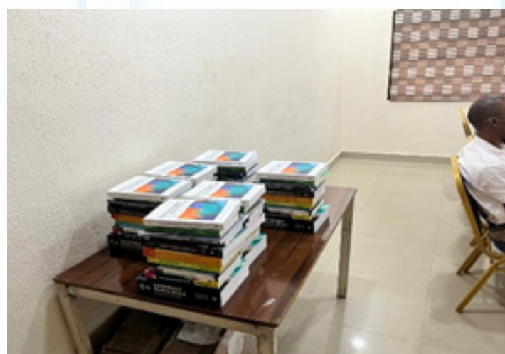
Figure 4: Textbooks and laptops that were provided for each trainee that was admitted for the program.