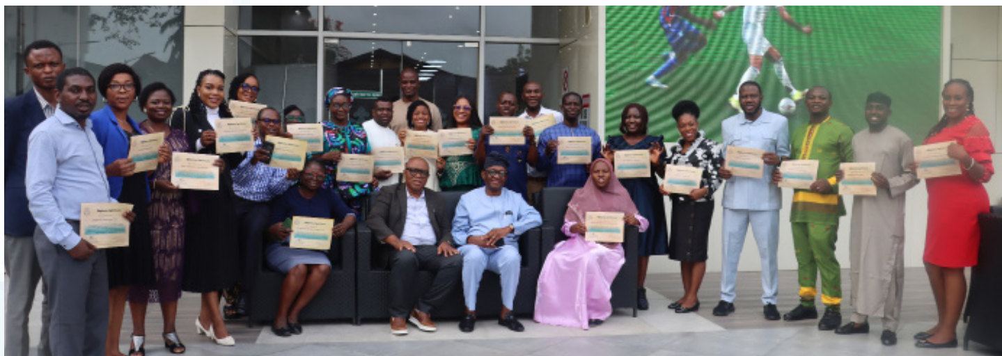
Figure 6: Participants of the RCR Diploma program holding certificates of completion at the end of the program.

The Center for Bioethics and Research (CBR) is proud of all the trainees that successfully completed the diploma program and wish them well in their endeavors.