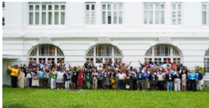
Figure 6: Attendees at the conference on ethical issues arising in research into climate change and health in Kuala Lumpur, Malaysia.

The conference focused on themes like Interdisciplinary Approaches, Co-production, and Integrating Indigenous Knowledge. Rethinking Research Ethics Governance, Research Agenda Setting and Uptake: Power, Justice, and Fairness, Impact of Health Research on Climate Change, New Research and Emerging Technologies: Balancing Speed and Caution.