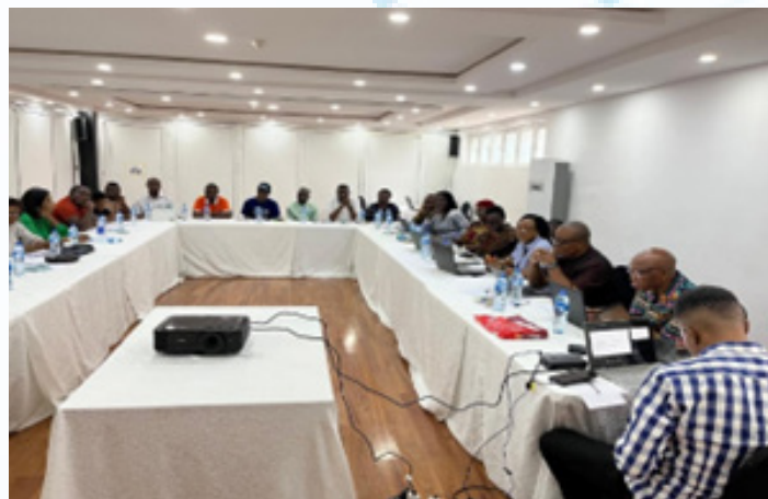
Figure 3: On the left: CBR Facilitators and staff. On the right, are Participants and facilitators during an interactive session at the Weekend Retreat of the diploma program.