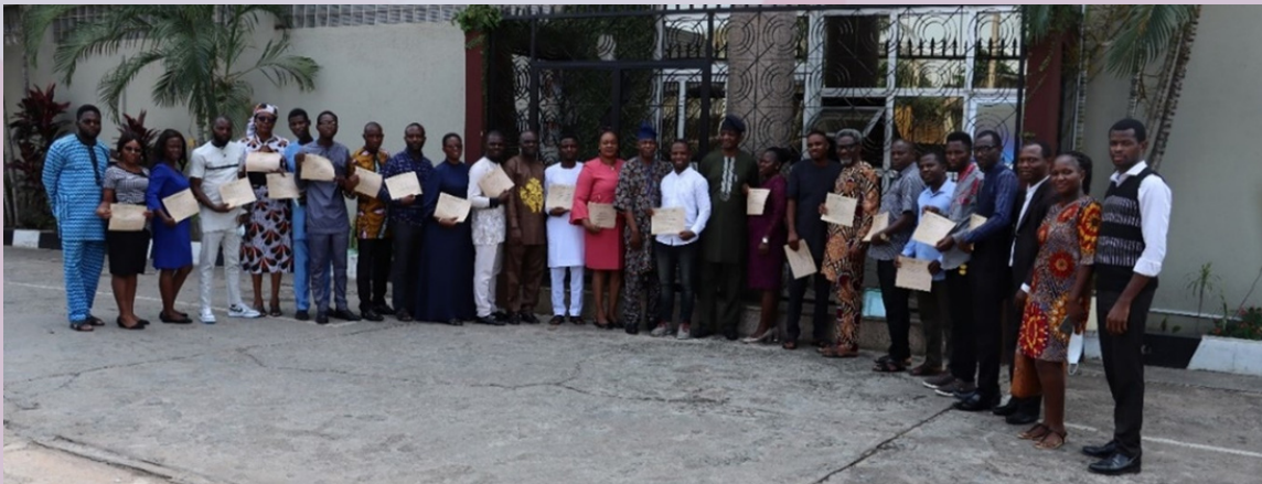
Coordinators of the diploma program and the First batch of 2021 diploma participants holding their certificates of completion at the end of the 3 - month program.

The Blended Diploma in Research Ethics is for individuals with interest in research ethics who desire to acquire more competence in research ethics and bioethics but are unable to take advantage of the 18 months fully sponsored M.Sc. Bioethics program at the University of Ibadan and University of Nigeria. The Program is generously funded by the United States' National Institutes of Health Fogarty International Center and the National Human Genome Research Institute.