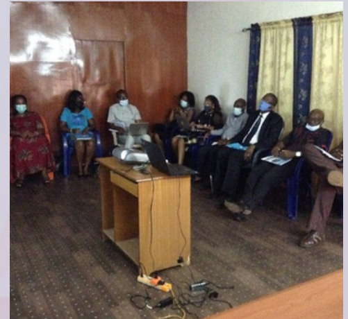
Faculty members of the UNN Bioethics program and MPH Program with Bioethics concentration during the students' presentation

The process for admission of students into the MSc Bioethics program for the 2021/2022 academic session has commenced. Interested applicants should visit the website of the Postgraduate College of the University of Ibadan at https://pgcollege.ui.edu.ng for information on how to obtain the application form and admission requirements.