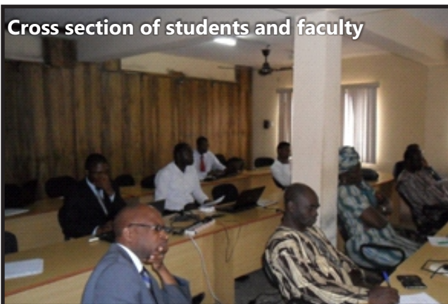
Cross section of students and faculty

Following each presentation, students and faculty took turn to comment on the presentation and also ask the presenter constructive questions.