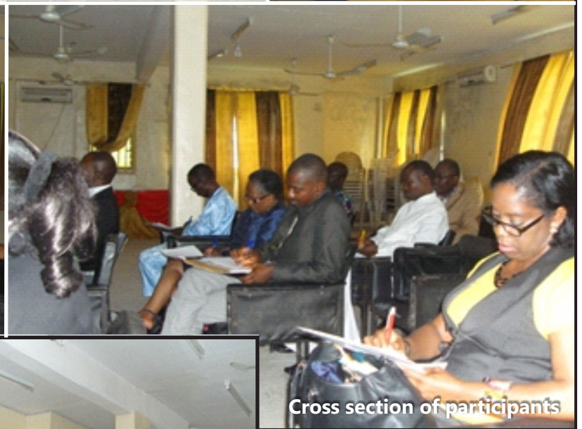
Cross section of participants