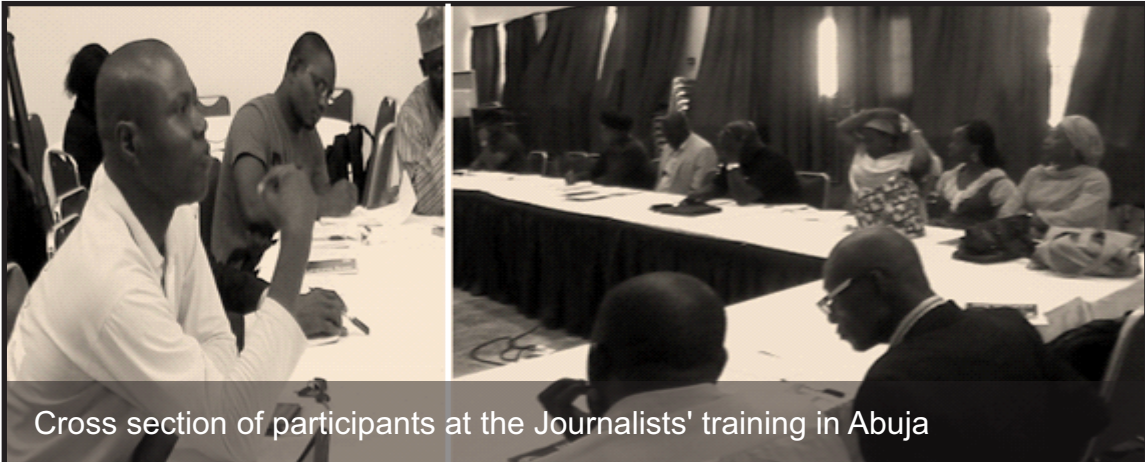
Cross section of participants at the Journalists' training in Abuja