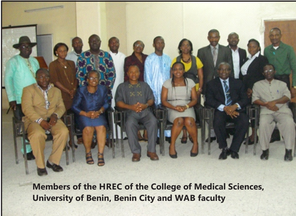
Members of the HREC of the College of Medical Sciences, University of Benin, Benin City and WAB faculty