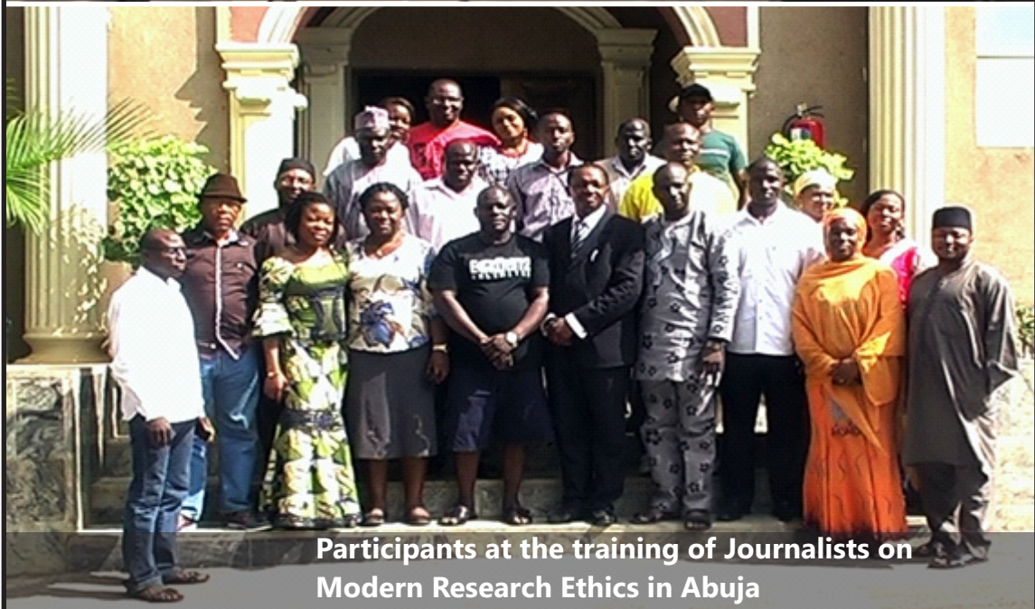
Participants at the training of Journalists on Modern Research Ethics in Abuja