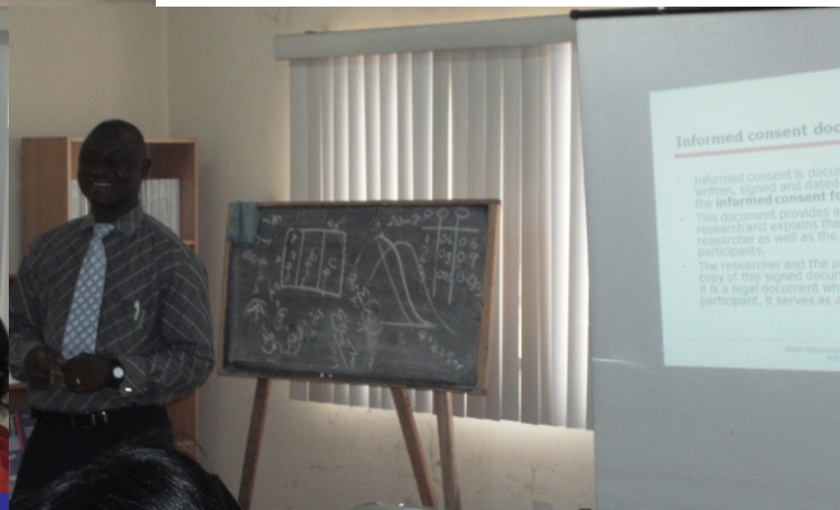
One of the facilitators giving lecture on Informed consent