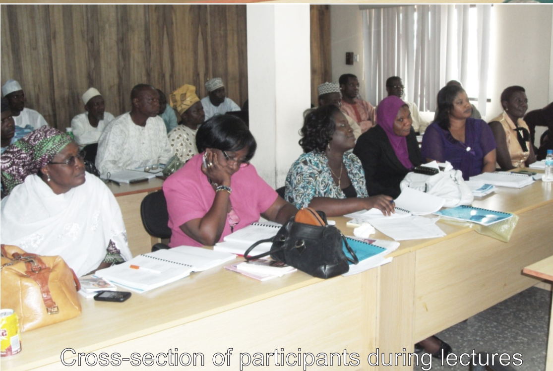
Cross-section of participants during lectures