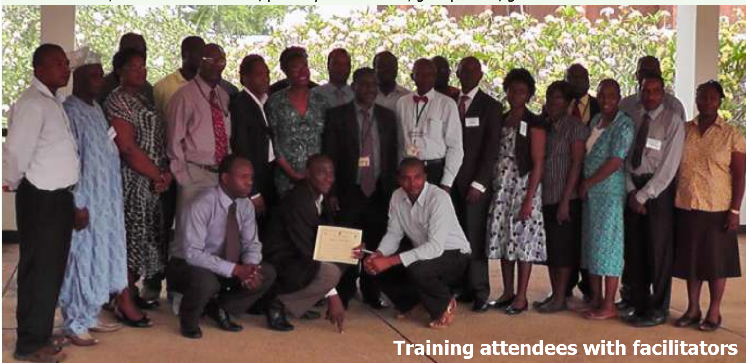
Training attendees with facilitators

A three days workshop was organised by the Institute of Public Health, Obafemi Awolowo University in partnership with New HIV Vaccine and Microbicide Advocacy Society. The training curriculum was accredited by the National Health Research Ethics Committee (NHREC/TR/05/02/2012) and the Medical and Dental Council of Nigeria. The theme of the training was 'Ethics of Biomedical Health Research'. The training came up between the 15th and 17th of February, 2012 at the Institute of Public Health, Obafemi Awolowo University, Ile-Ife, Nigeria. In attendance were 26 participants exclusive of the two facilitators. 18 plenary sessions were taken, which included history and evolution of ethics, principles of research ethics, informed consent, community participation in research, standard of care in research, engaging vulnerable communities, and monitoring of research amongst others. The training used various participatory mechanisms to facilitate learning. These include brainstorming, question and answer sessions, cases studies, mock HREC session, plenary discussions, group work, games and lectures.