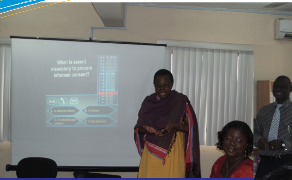
One of the participants on the 'hot seat' for the 'Who wants to be a millionaire game'