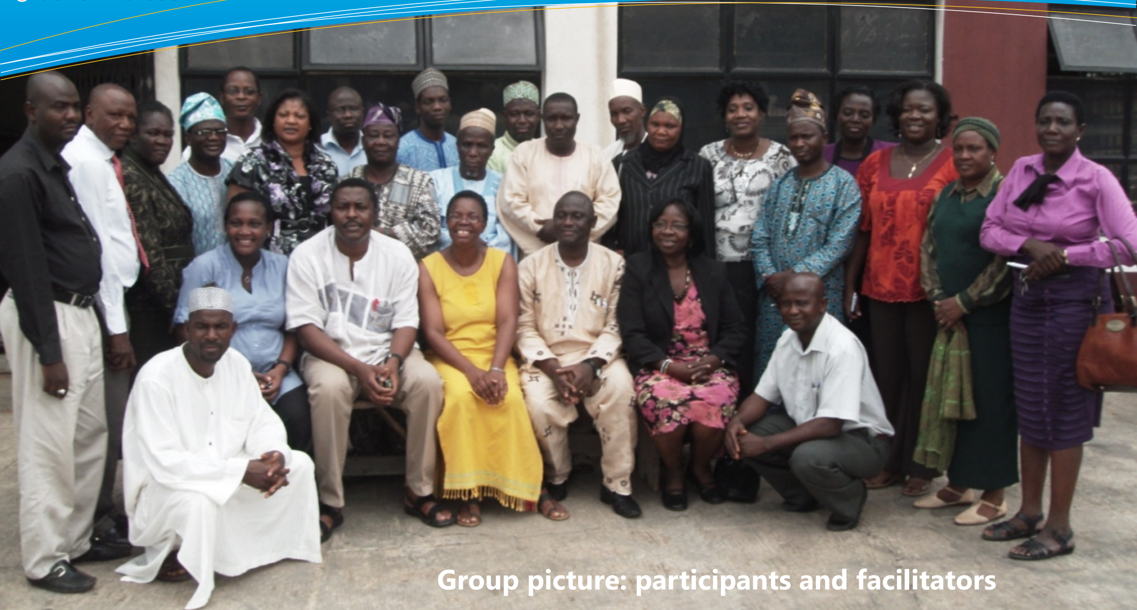
Group picture: participants and facilitators