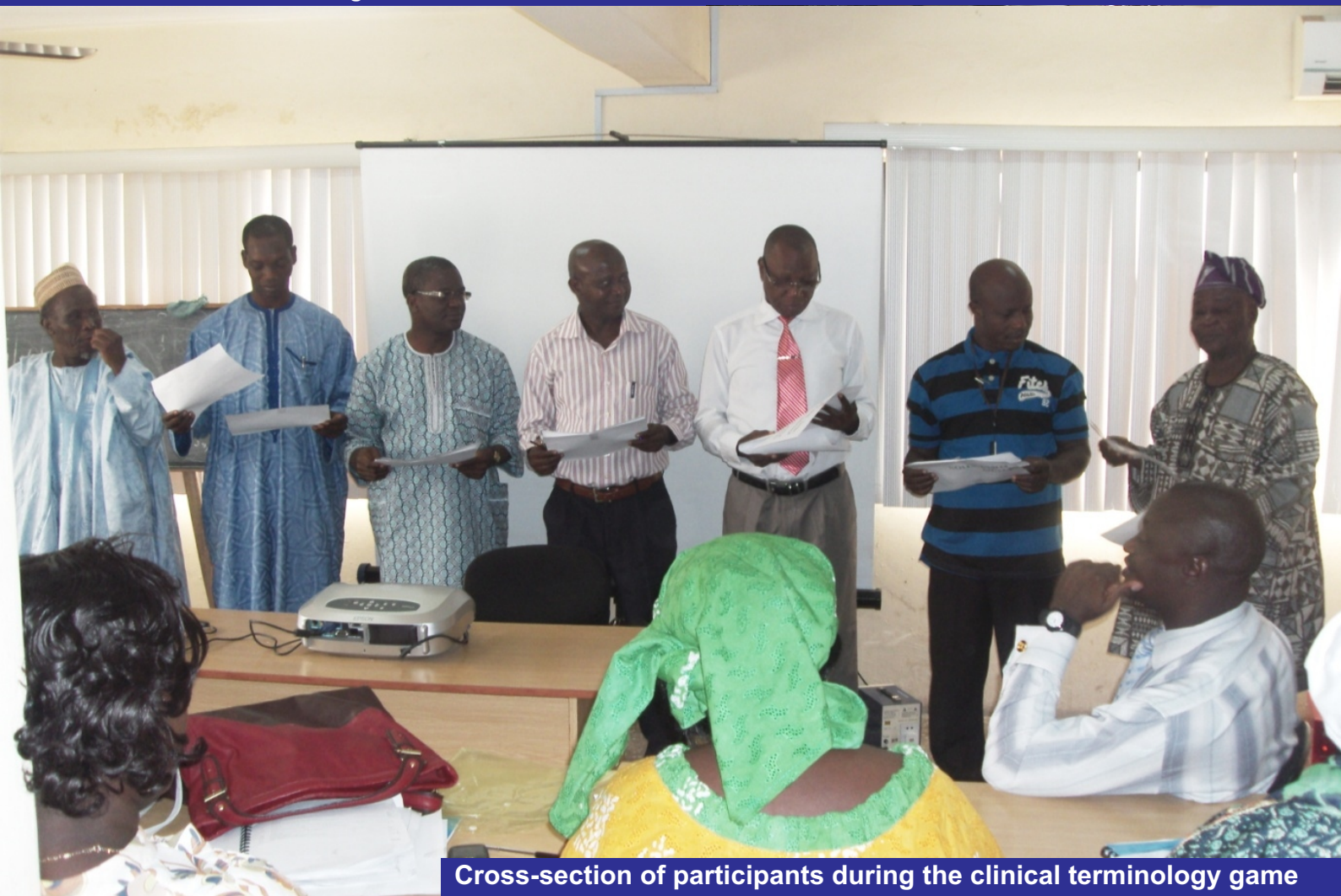
Cross-section of participants during the clinical terminology game