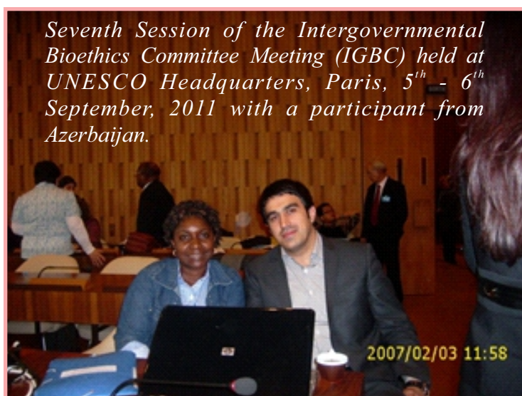
Seventh Session of the Intergovernmental Bioethics Committee Meeting (IGBC) held at UNESCO Headquarters, Paris, 5 th - 6 th September, 2011 with a participant from Azerbaijan.

On completion of my M.Sc. Bioethics program in 2011, I returned to my Agency, the National Biotechnology Development Agency (NABDA), Abuja. I was made the Head of Bioethics/Chief Scientific Officer (HBE/CSO) and my Agency was nominated as the Focal Point for Nigerian National Commission for UNESCO on Bioethics. Since my Agency is the Focal Point for Nigerian National Commission for UNESCO on Bioethics, it represents Nigeria for all Bioethics meetings within and outside the country. As the Head of Bioethics in my Agency, I represent Nigeria wherever Bioethics meetings are held. I represent Nigeria at the UNESCO International Bioethics Meetings (IBC) and the Intergovernmental Bioethics Committee Meetings (IGBC). I have presented several papers on Bioethics and was actively involved in establishing the Independent Institutional Review Board of the African University of Science and Technology (IIRB-AUST).