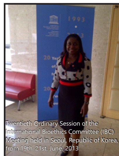
Twentieth Ordinary Session of the International Bioethics Committee (IBC) Meeting held in Seoul, Republic of Korea, from 19th-21st, June, 2013