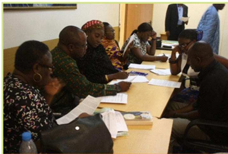
Participants at the workshop during practical session

The workshop evaluation showed that participants had indeed acquired new knowledge and skills. The mean pretest score was 24%. The scores ranged from 0% to 55%. Eighty three percent of those who took the pretest scored less than 40%. The mean post test score was 47%. The scores ranged from 30% to 90% with one participant scoring less than 40%. They all could identify new skills they had acquired and the new things they plan to do with the skills acquired.