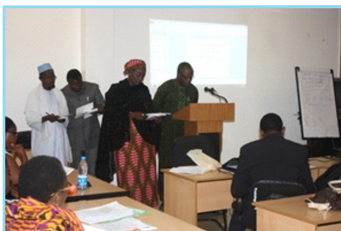
Participants during the 'clinical trials terminology game'