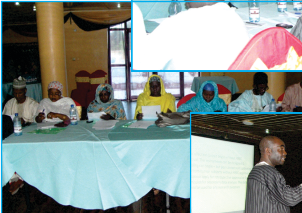
Female participants at the workshop