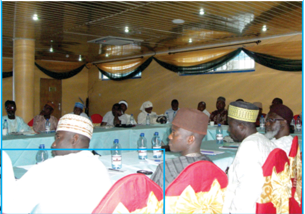
Participants listening to the ongoing plenary session