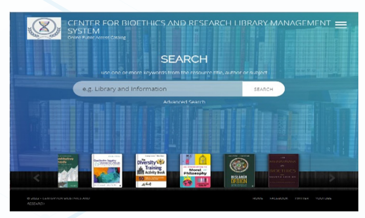
Figure 7: Bioethics library of the Center for Bioethics and Research, Ibadan, Nigeria

The Center for Bioethics and Research (CBR) Bioethics Library is the most comprehensive repository bioethics books, journals, and other educational materials for students, faculty members, and researchers in Nigeria. It is available to all individuals interested in bioethics research and training. The library empowers students and faculty to discover and obtain information needed for their research in Protection of Human Participants in Research, RCR, RSI, DEI, Safe Working and Sexual Harassment free Environment. The librarian can be contacted, and the library's catalogue can be viewed through http://library.bioethicscenter.net