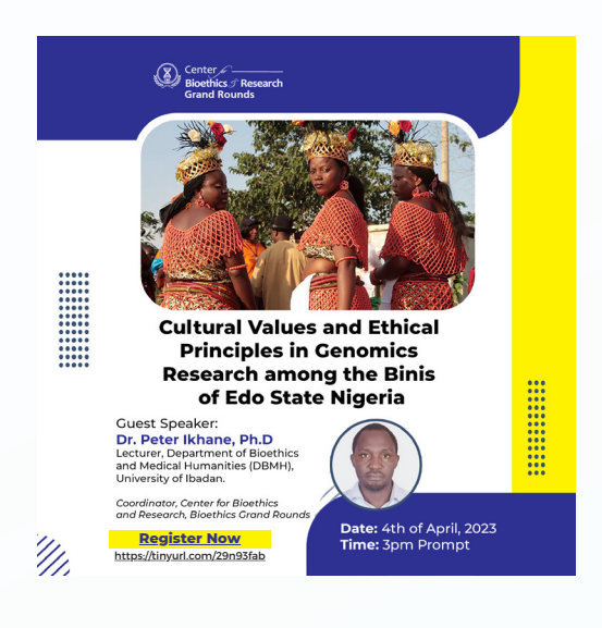
Figure 9: Event Poster for the CBR Grand Round.

The Grand Rounds of the Center for Bioethics and Research is a new and innovative program designed to educate and enable development of bioethics research capacity in Nigeria. The Grand Round will hold monthly and feature presentations on Bioethics by faculty, local and international guest speakers. Trainees will also have an opportunity to present work-in-progress related to their research projects during these rounds.