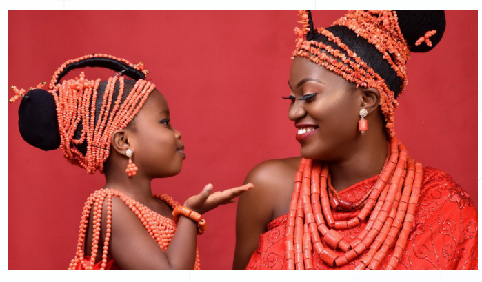
6.2 Grand Rounds of the Center for Bioethics and Research (GR-CBR).

The Grand Rounds of the Center for Bioethics and Research is a new and innovative program designed to educate and enable development of bioethics research capacity in Nigeria. The Grand Round will hold monthly and feature presentations on Bioethics by faculty, local and international guest speakers. Trainees will also have an opportunity to present work-in-progress related to their research projects during these rounds.